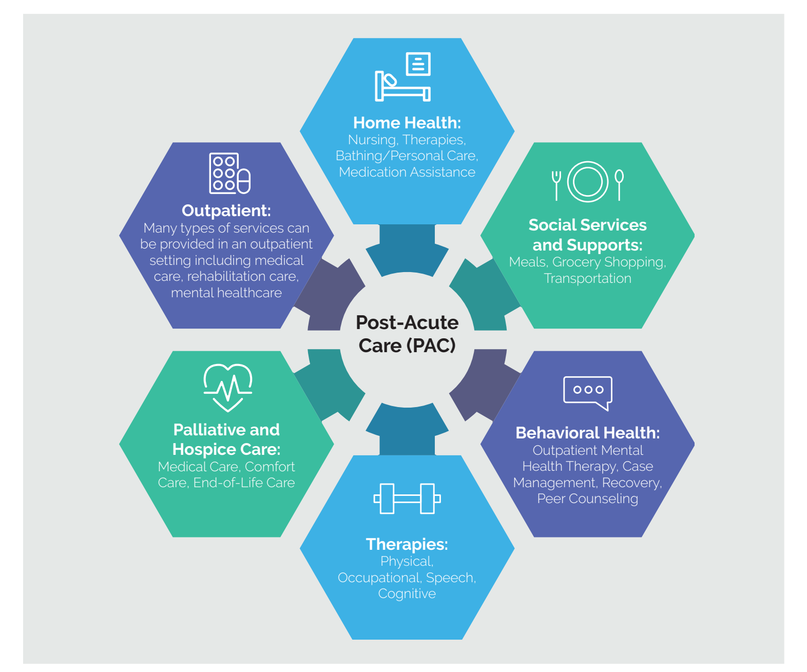
Figure 1. Post-acute care services

Post-acute care (PAC) includes a range of services to address your goals and needs. PAC services can be provided at home, in an outpatient setting in your local community like a doctor's office or hospital clinic, or at a facility for a short-term stay like a nursing home. You should work with your provider to ensure that the care planning process meets the care goals that you and your family have set and that they are addressed in a comprehensive way. The PAC planning process should also address any behavioral health needs you have for mental health and/or substance use disorder services. Always check with your health plan or insurance company to ensure that the services that you need are covered.